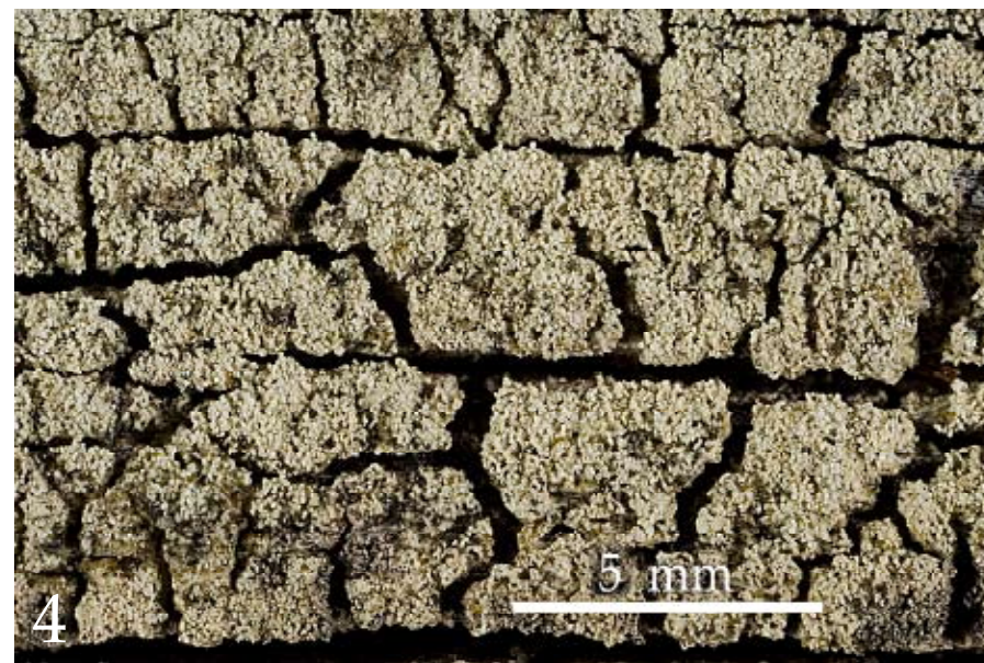
Figure: 1. Pertusaria albopunctata (holotype in BRI); 2. Pertusaria alectoronica var. thiophanica (holotype in HO).