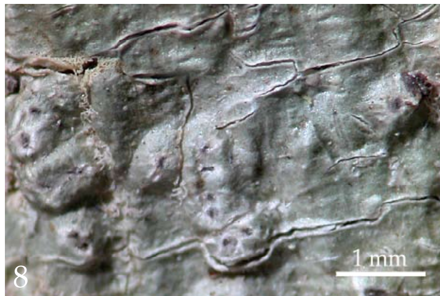
7. Pertusaria malmei (J.A. Elix 39075 in CANB); 8. Pertusaria subradians (J.A. Elix 38500 in CANB).