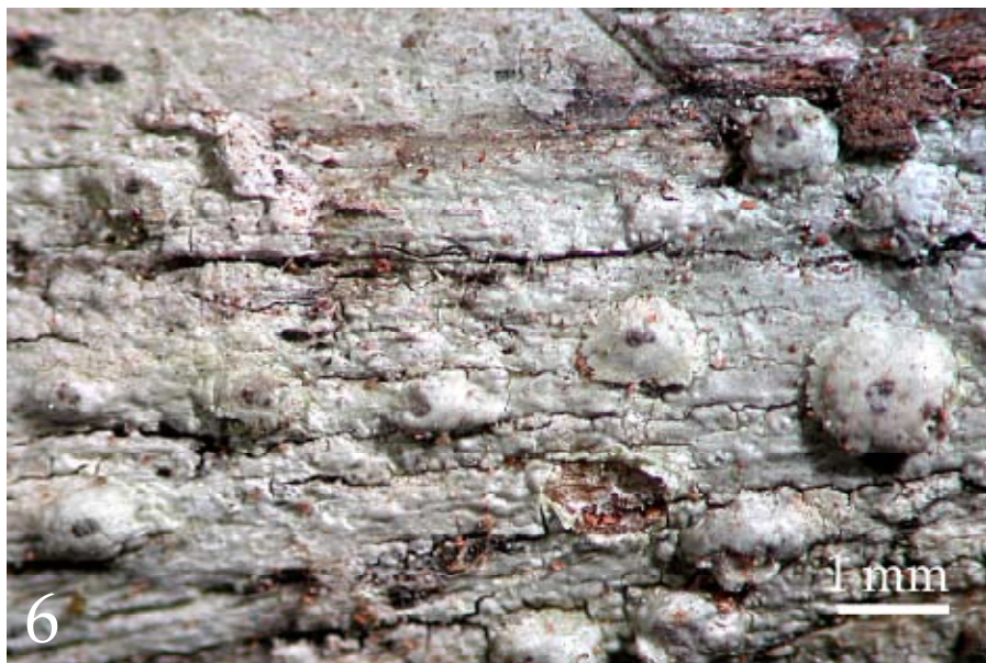
5. Pertusaria minispora (holotype in MEL); 6. Pertusaria tjaetabensis (holotype in CANB).